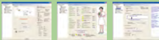
FULL STATUS MONITOR