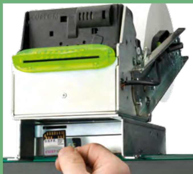
FISCAL VERSION WITH ELECTRONIC JOURNAL