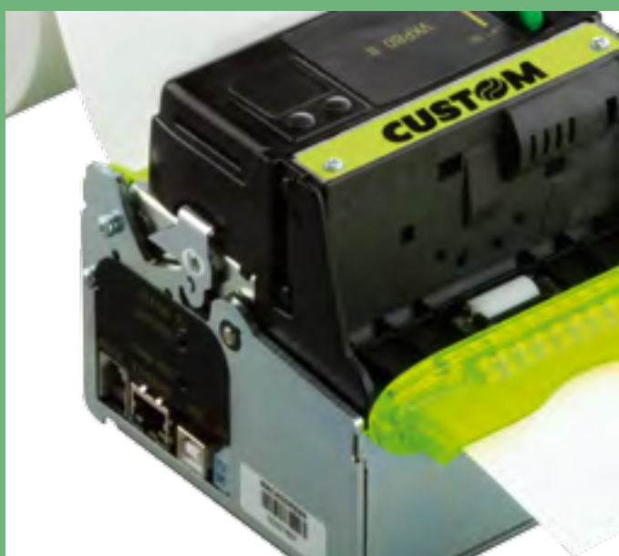
ETHERNET VERSION WITH WEB SERVER